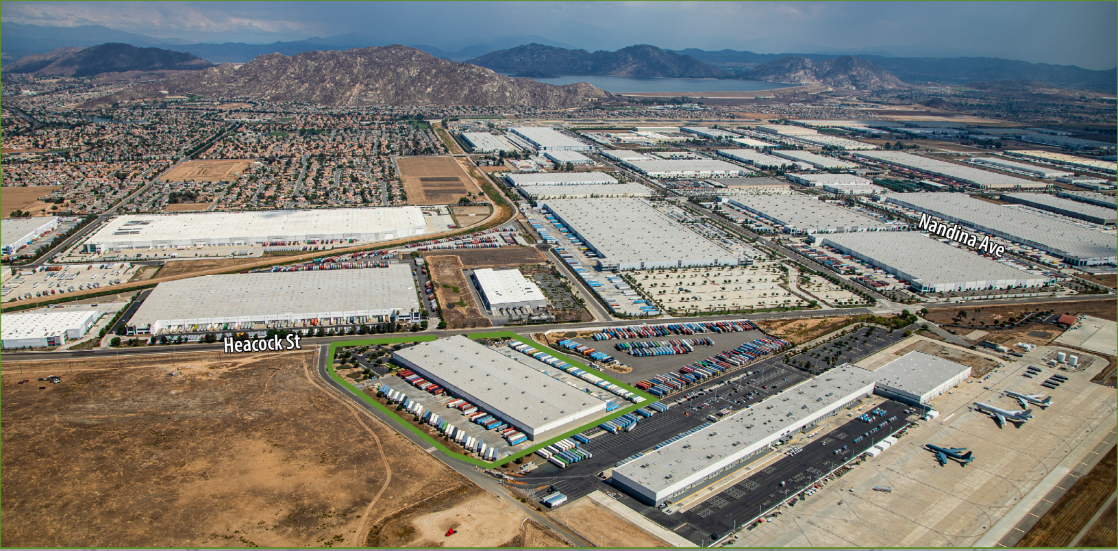
First Heacock • 16875 Heacock Street • Moreno Valley, CA