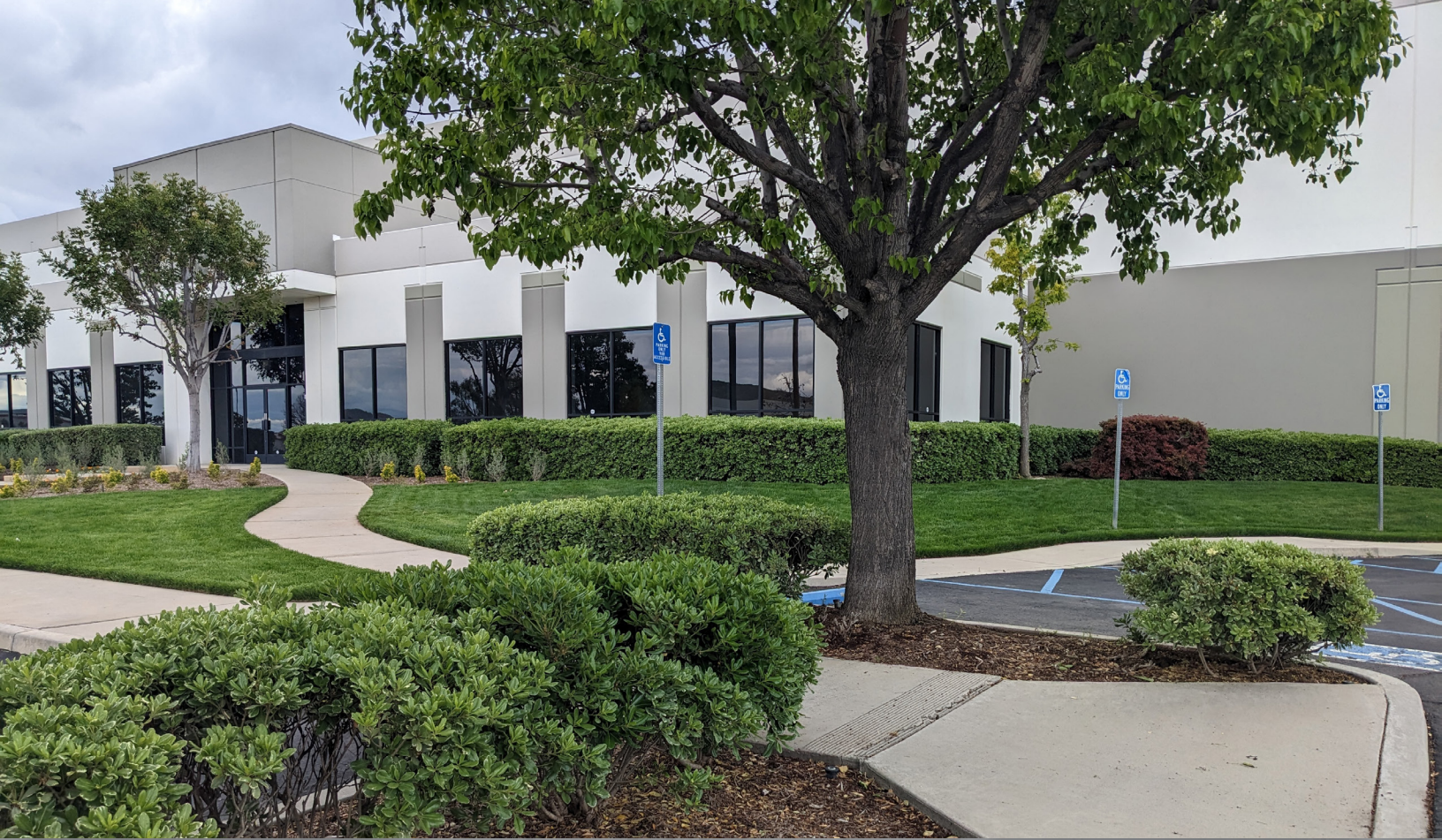
First Heacock • 16875 Heacock Street • Moreno Valley, CA